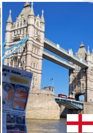
Tower Bridge, London.