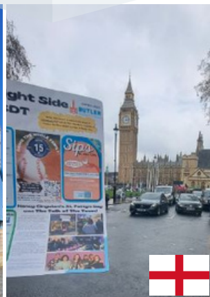
Big Ben, London.